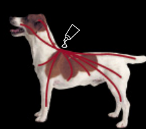
Application for dogs under 25kg

On dogs less than 25kg, Advantix should be applied as a single dose between the shoulder blades. On dogs heavier than 25kg, divide the dose into three spots, one between the shoulder blades, one on the midline of the back between the hips and one at one point in between.